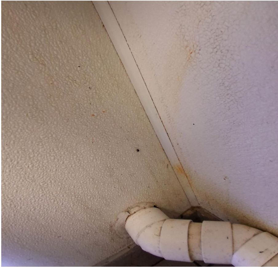
A nymph on the wall in the rear preparation room.