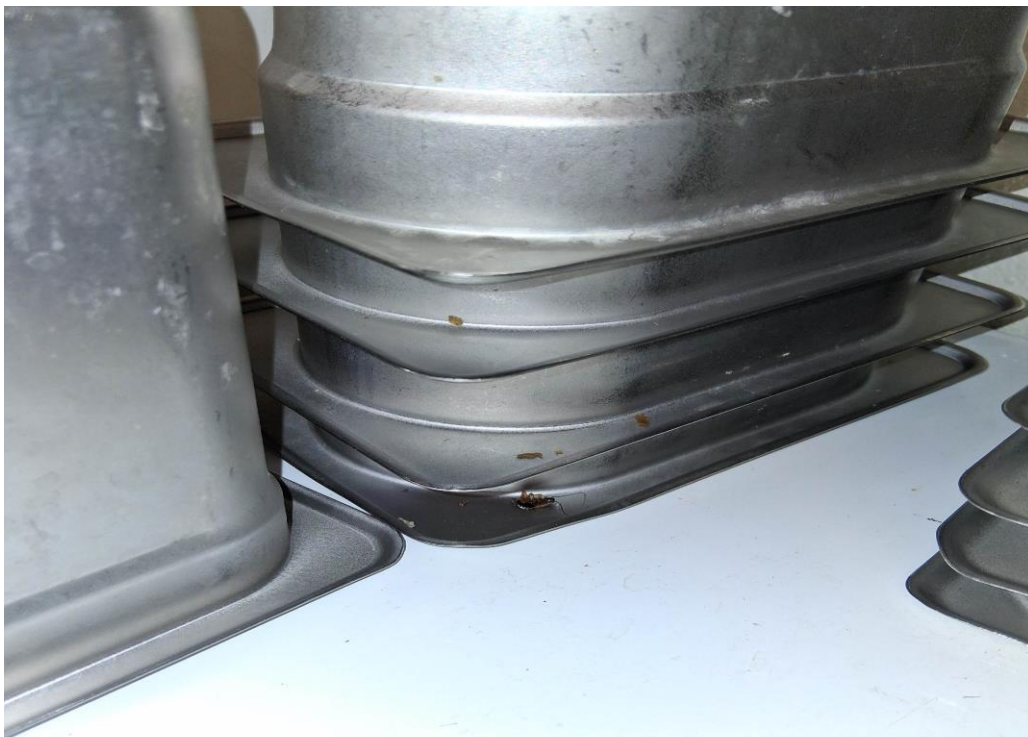
A dead cockroach on a metal container in the rear preparation room.