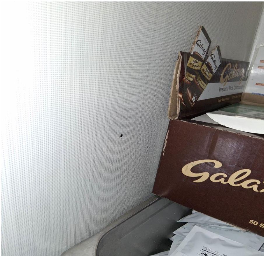
A nymph on the wall in the servery.