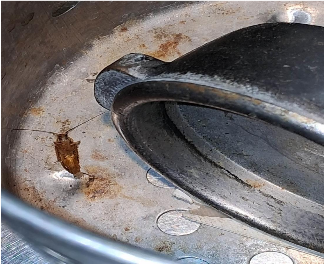
A dead cockroach next to coffee equipment in the servery.