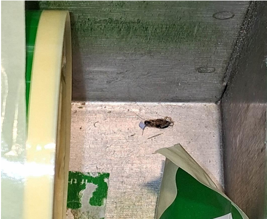
A dead cockroach in a box of labels in the servery.