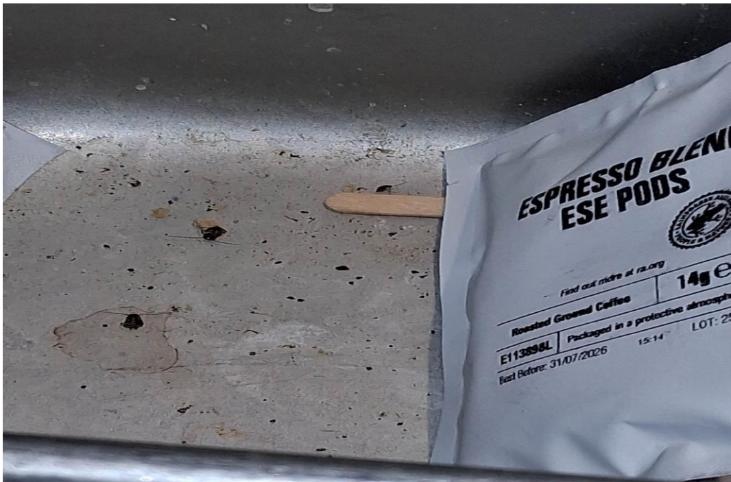
Dead nymphs next to packets of coffee in the servery.